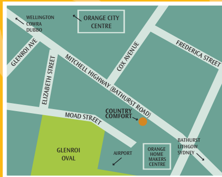
Country Comfort Orange to: